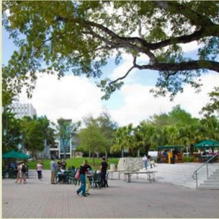
Rock Plaza and U Statue