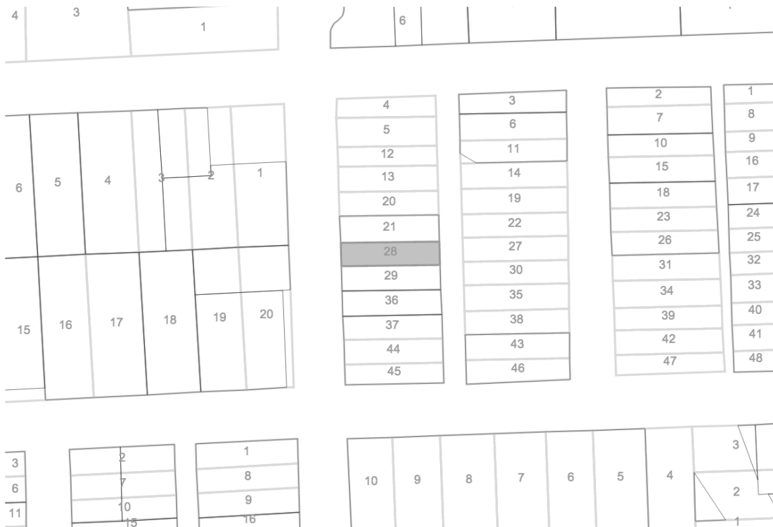
Lot 28, Miami-Dade County Property Appraiser (2015).