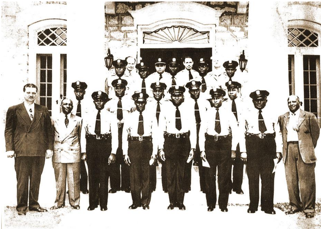
Judge Thomas is pictured in the front row, second to the right along with Miami's black patrolmen (c. 1952).

On May 22, 1950, Thomas began presiding over the Negro Municipal Court. Located in Overtown at NW 11 th Street and NW 5 th Avenue, the precinct building included a police station, courtroom, and judge's chamber (Chapman 71).