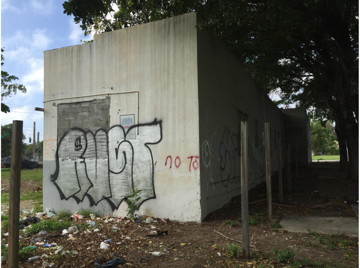
Western elevation (2015).