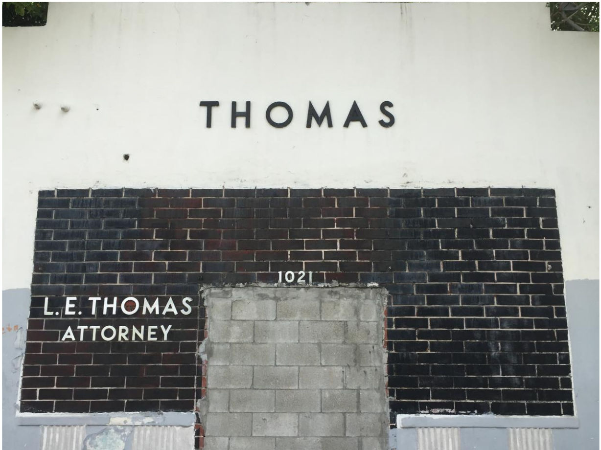
1021 NW 2 nd Avenue: Original signage above the front door (2015).