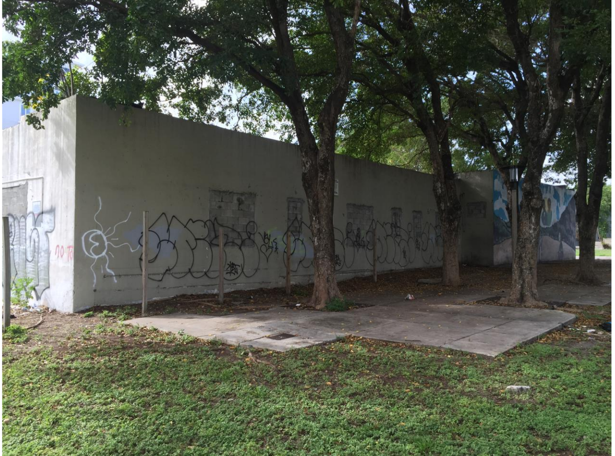
Southern elevation (2015).