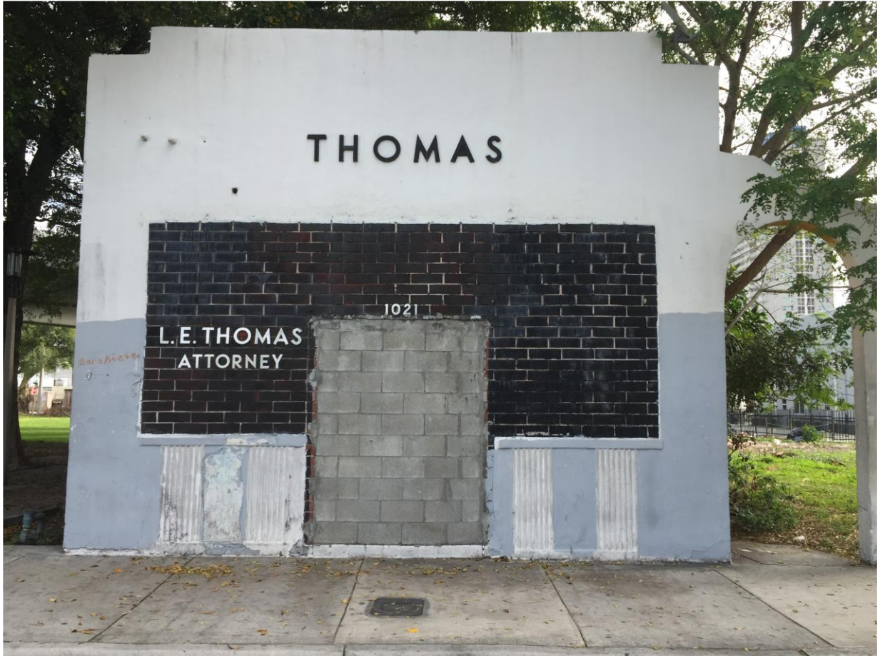
Eastern elevation (2015).