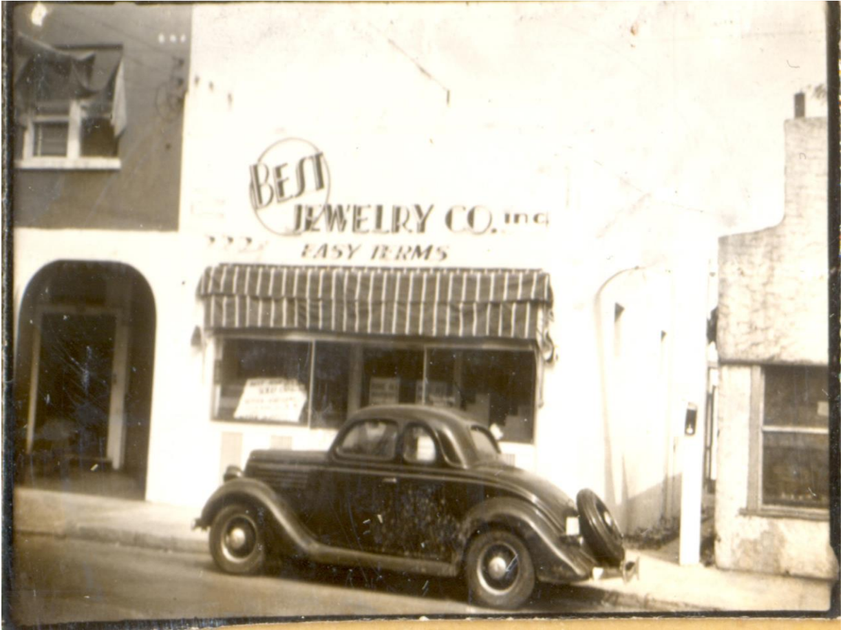
City of Miami Tax Historic Tax Card Photo, 1021 NW 2 nd Avenue (c. 1940s).