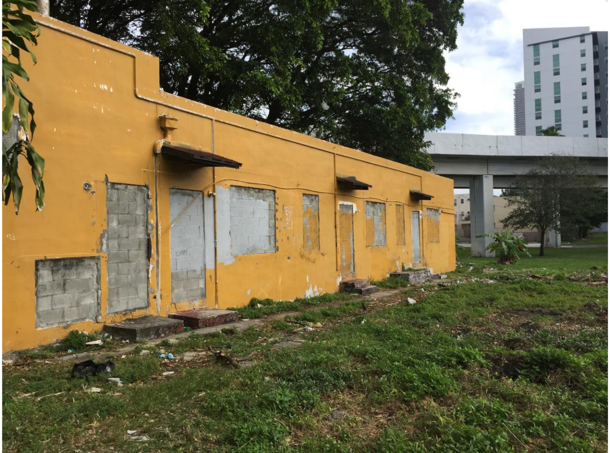
Northern elevation (2015).