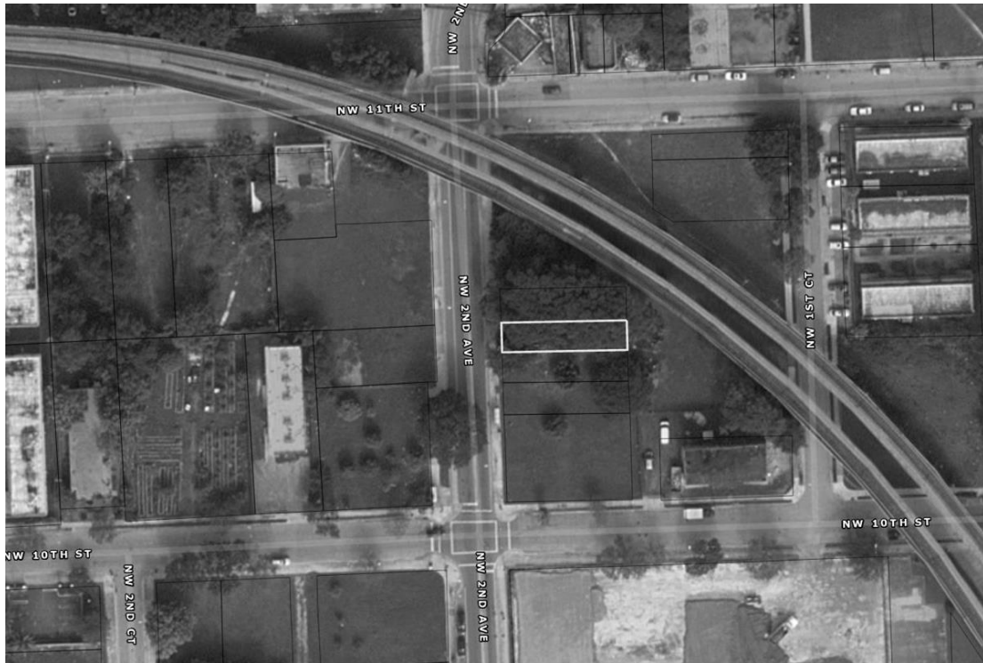
1021 NW 2 nd Avenue, between NW 10 th Street and NW 11 th Street, Miami-Dade County Property Appraiser (2015).