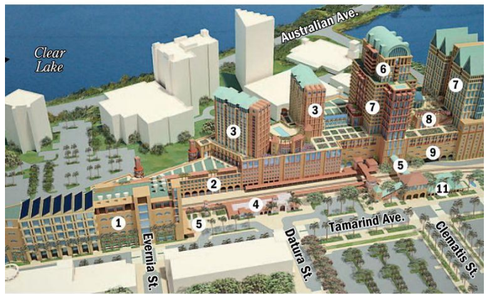
iel Graves and Associates Inc.; REG Architects Inc.